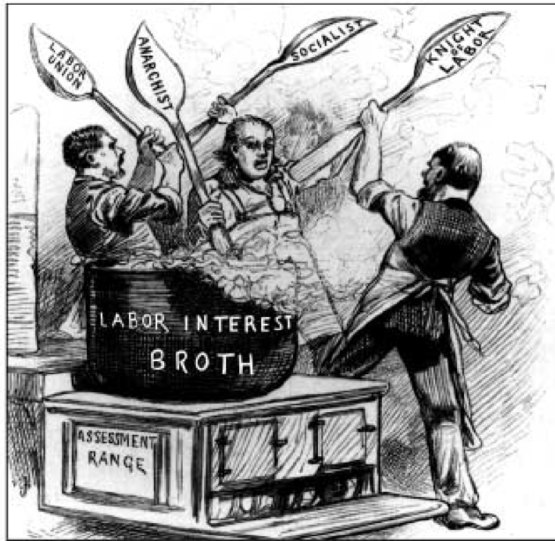
TOO MANY COOKS SPOIL THE BROTH.